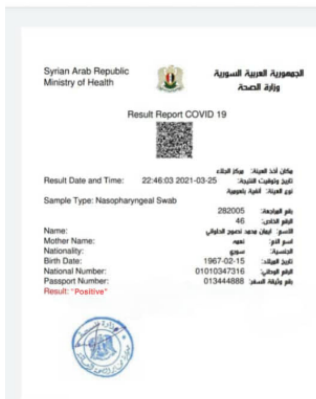
FIGURE 1: Dr Iman POSITIVE TEST