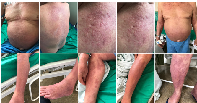
FIGURE 3: After corticotherapy, the patient evolved withresolution of the desquamation process of the lesions and reduction of theinflammatory and erythematous process.

of inflammation, and resolution of the desquamation processFigure 3 .