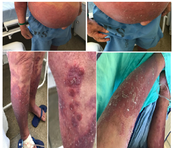
FIGURE 1: erythematous lesions with generalized thin and delicate scales and intense rederythema besides numerous previously ruptured pustules.

improvement regarding the described symptoms and Attenuation of the desquamation of the plaques, leaving only erythematous plaques. He was referred to the medical clinic sector of the Regional Hospital of Cacoal-RO for diagnostic elucidation. On admission, he denied any history of dermatological pathologies in first-degree relatives, but mentioned that a niece (his brother's daughter) was diagnosed with psoriasis one year ago. Mother died of neoplasia at 78 years of age and father died of a traffic accident. On physical examination, vital signs unchanged, he presented erythematous, largely non-descaling lesions on skin and focus of inflammatory process. Figure 1. Umbilical hernia of approximately 4 cm, not reducible, and edema in the lower limbs. Laboratory tests were negative for HIV, Syphilis, Hepatitis A, B and C. He was evaluated by the dermatology service that hypothesized pityriasis rubra pilaris, leprosy reaction, mycosis fungoides, and erythroderma. He started treatment with clobetasol ointment for 14 days and sunflower oil on the lesions, in addition to increased hydration.